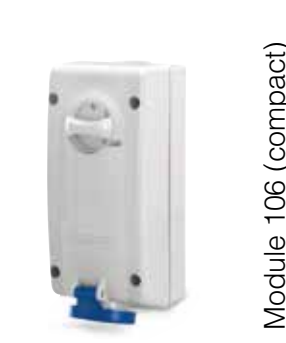
Module 106 (compact)