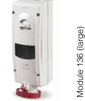
Module 136 (large)